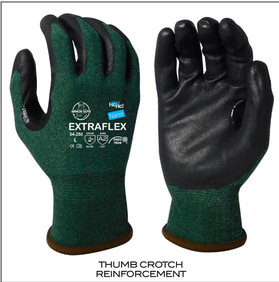
THUMB CROTCH REINFORCEMENT